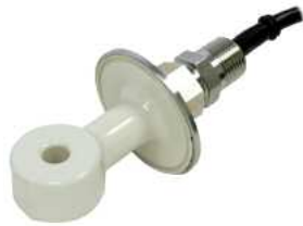
225 CIP Toroidal Conductivity Sensor

225 CIP Sensor The Model 225 Clean-in-Place (CIP) sensor is designed for applications in the food and beverage industries where processing equipment is routinely cleaned with 2% caustic at temperatures up to 100 degrees C. Process installation is made with a customer supplied two-inch TriClamp®. The Tri-Clamp design in unfilled PEEK meets 3A sanitary standards and is FDA compliant for repeated food contact applications.