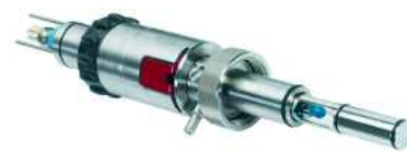
Hx Retractable Sensor Mounting Assembly

Retractable Sensor Mounting Assembly Designed for use with Rosemount Analytical steam sterilizable pH and DO sensors, the assembly is built to withstand clean-in-place cycles. The sensor can be withdrawn without interrupting the process. An integral safety mechanism prevents the assembly from being inserted into the process without the electrode being installed. While in the retracted position, the sensor can be cleaned with water or buffer solutions. The retractable assembly is manufactured with 316 stainless steel and FDA approved EPDM o-rings.