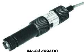
Model 499ADO Sensor

Model 499ADO Dissolved Oxygen Sensor The Model 499A Dissolved Oxygen (DO) sensor accurately measures dissolved oxygen in a variety of applications, particularly industrial wastewater. For process liquids that foul and coat the membrane, the Air Blast Cleaner System is available.