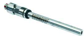
Bx438 Dissolved Oxygen Sensor

The design of the membrane is the key to achieving high performance and decreased maintenance. The electrode construction guarantees excellent stability even after numerous sterilization cycles. The cost to maintain the Bx438 sensor is approximately one-third the cost required to maintain competitive dissolved oxygen sensors.