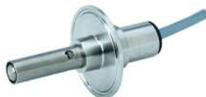
Model 403 Sensor

The sensor also features a 16 micro inch Ra surface finish to meet the demand for hygienic finishes in the food industry. All wetted plastics and elastomers are compliant with 21CFR177.