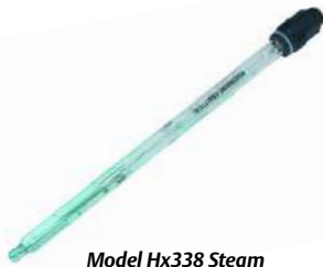
Model Hx338 Steam Sterilizable pH Sensor

Model Hx338 Steam Sterilizable pH Sensor The Model Hx338 Sensor is specifically designed for biopharmaceutical and food processes. The sensor's unique tri-triple reference technology helps to maintain a drift-free pH signal and performs exceptionally well against poisoning agents (sulfides, proteins, or sugars), even after numerous sterilization cycles. The Hx338 can also withstand high protein and salt concentrations. These features make the sensor ideal for purification processes.