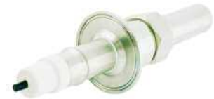
Model TF396 Non-Glass pH Sensor

TF396 The industry proven, patented TUph™ reference junction of the TF396 sensor sets a new standard for cost-of-ownership of pH and ORP in harsh applications. The TUph reference junction resists the effects of process