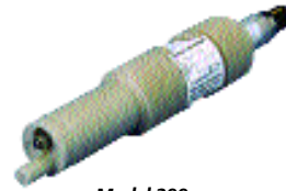
Model 399 pH Sensor

Model 399 pH and ORP Sensor This is a general purpose sensor that features an annular ceramic junction surrounding the pH/ORP sensitive membrane. The double-junction