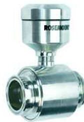
Model 245 Flow-Through Toroidal Conductivity Sensor

245 Flow-Through Conductivity Sensor The Model 245 Sanitary Flow-Through Toroidal Conductivity