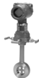
Rosemount 3051SFC Compact Conditioning Orifice Flowmeter