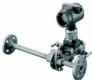
Rosemount 3051SFP Integral Orifice Flowmeter