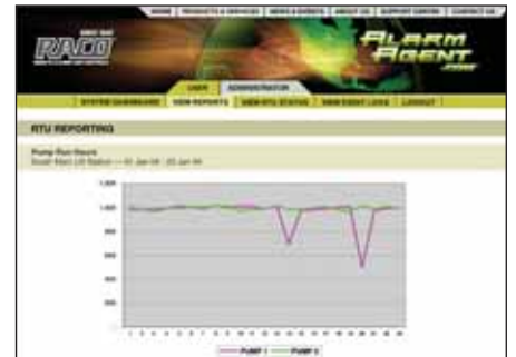
Reporting Screen Analyze data to optimize system efficiency

With a few simple clicks, your interface will produce your selected reports, including Pump Runtime, Pump GPM, Pump Starts Ratio, Pump Station Flow, WRTU Commands, Analog Reading, and Arm/Disarm.