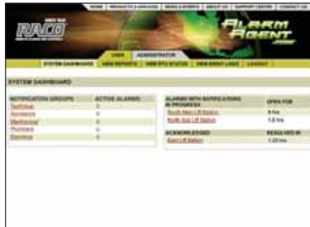
System Dashboard Screen Review and access alarms from a single screen

AlarmAgent.com's user-friendly, Web-based interface puts everything you need right at your fingertips. The easy-to-use control panel allows you to access WRTU status, notification order and contact preferences, alarm activity (even across multiple stations), and details of alarm acknowledgment activity. And no additional software is required.