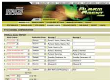
WRTU Channel Configuration Screen Reconfigure channels in seconds

AlarmAgent.com provides extreme flexibility for custom configuration. Add stations. Change alarm parameters. Manage users and update their notification preferences. All this functionality and more is possible through clear instructions and drop-down menus that allow you to manage your selections in just seconds.