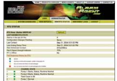
WRTU Status Screen Get the complete status of your WRTUs anytime

report — Generate comprehensive reports on-demand with just the click of a mouse.