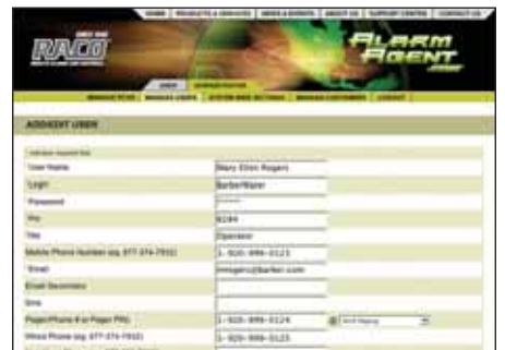
Add a User Screen Easily change user permissions and preferences